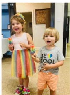
Pride & Pentecost Sunday

During a mental health crisis, anyone can call the 24-hour National Suicide Prevention Lifeline at 1-800-273-8255. Veterans crisis line is 800-273-7255.